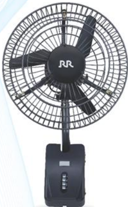
Wall Mount Fan