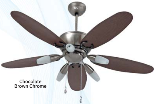
Chocolate Brown Chrome