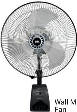
Wall Mount Fan